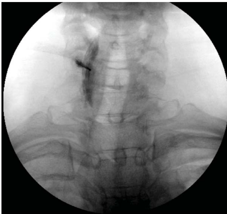
Fig. 3. Fluoroscopy (AP view) shows accurate placement without vascular contrast uptake during right stellate ganglion block.

This patient has multiple factors which are known to be causative or associated with secondary Raynaud's. The presence of Raynaud's is exceptionally common and part of the diagnostic criteria for MCTD. While our patient's Raynaud's is most likely due to MCTD, coagulopathy and idiopathic thrombocytopenia likely influenced the severity of the symptoms (3). Despite digital ulceration being less common in MCTD than scleroderma, a sizable proportion of patients still develop digital ulceration and Raynaud's due to MCTD (8). It is likely that the presence of a hematological disorder resulted in an increased risk of ulceration, but angiography demonstrated diffuse bilateral vasospasm as the primary physiological cause of her disease.