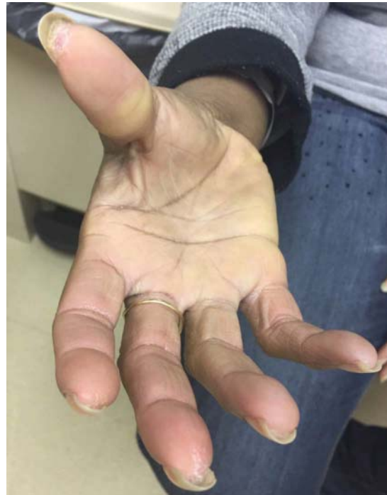
Fig. 4. Demonstrates right thumb and digits 2 through 5 after 12 stellate ganglion injections. The right thumb (A) is nearly healed, while the index finger has (B) good peripheral blood flow, good underlying tissue, and perfusion without eschar.

This case differs from previously published cases because most reported cases were in patients not heavily pretreated with multiple usually effective medications (calcium channel blockers, phosphodiesterase inhibitors, pentoxifylline, etc.), who did not have evidence of diffuse vasoconstriction on angiography consistent with sympathetic over activation and did not undergo stellate ganglion block as a last resort prior to likely amputation, which was the case in our patient. Despite its utility in this case,